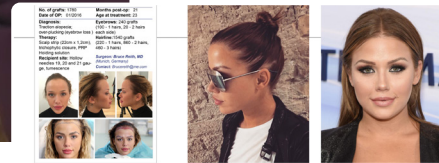
Receding Hairline (Traction alopecia)